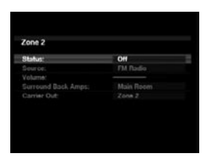
Figure 36 - Zone 2 Menu

NOTE : When the Zone 2 Video Output is connected to a display, a text-based version of the menu will appear. However, no menus will appear when USB, Internet Radio or the Network is selected as the source in either the main or remote zone, and a different source is selected for the other zone.